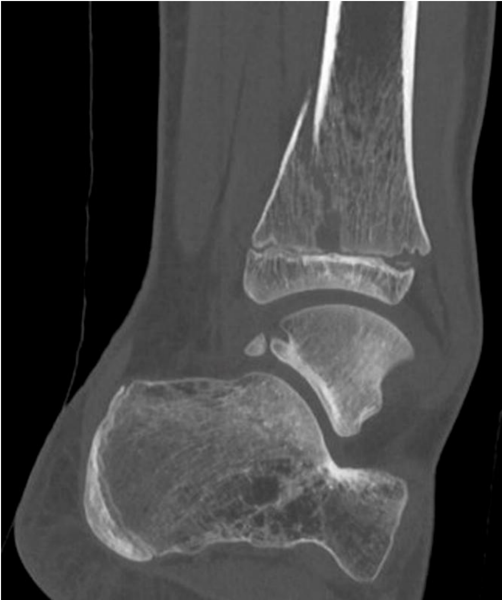
Description: Sagittal CT of the ankle. The third fracture line runs in the coronal plane through the posterior third of the metaphysis of the tibia above the level of the physis.