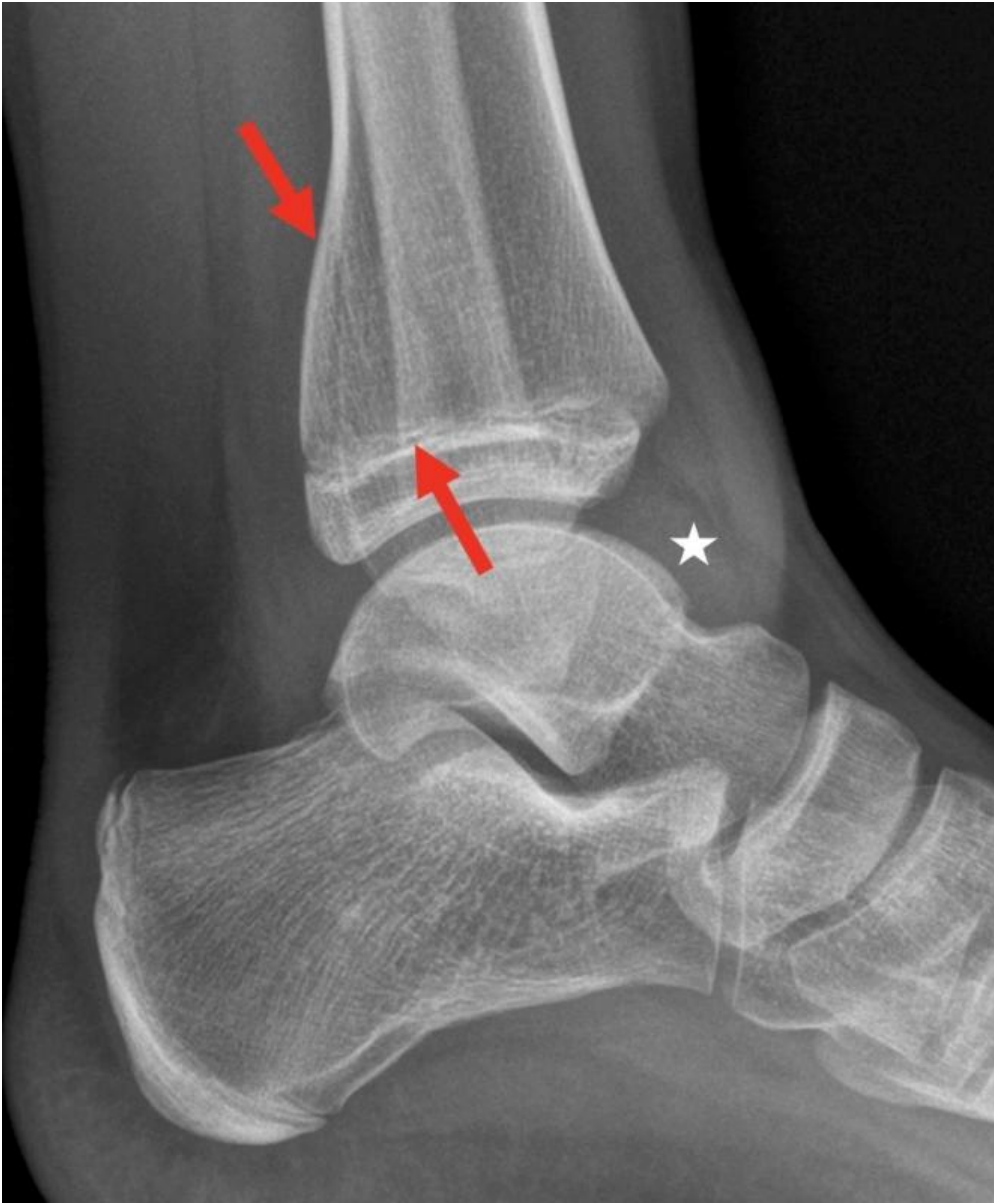
Description: Conventional X-ray of the ankle, lateral view. Vertical fracture through the malleolus tertius (arrows) with joint effusion in the anterior recess of the tibiotalar joint (asterisk).