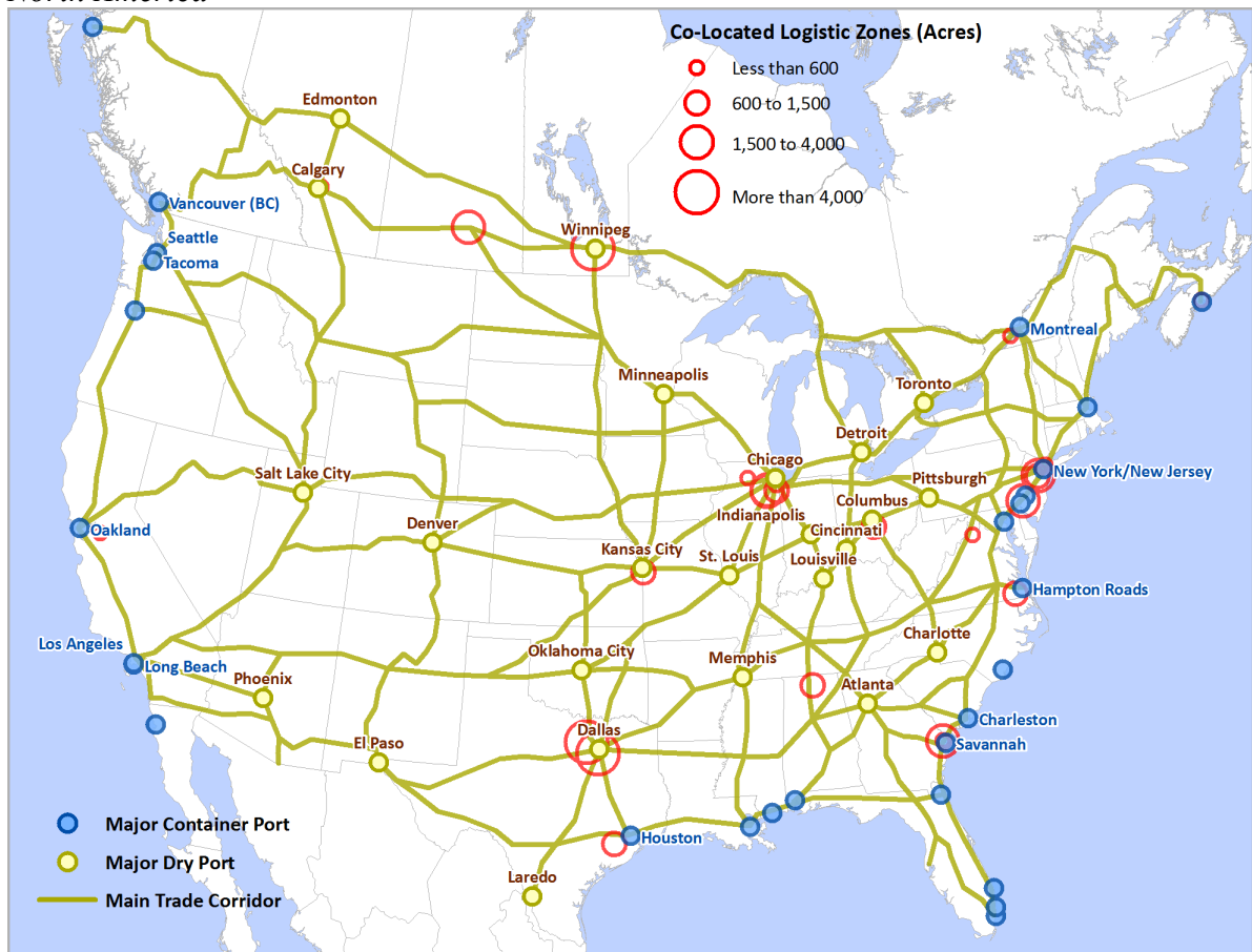
Figure 3: Main Trade Corridors, Dry Ports and Selected Co-Located Logistic Zones in North America

Compared to Europe, North American dry ports tend to be larger, but covering a much more substantial market area. Most of the North American dry ports initially developed