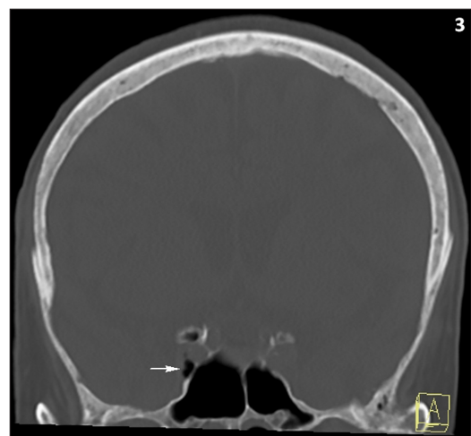
Figure 3: CT of the skull, bone window, coronal reformatted image. Air bubbles at sinus cavernosus (white arrow). Normal pneumatisation of the sphenoid sinuses and absence of a fracture.