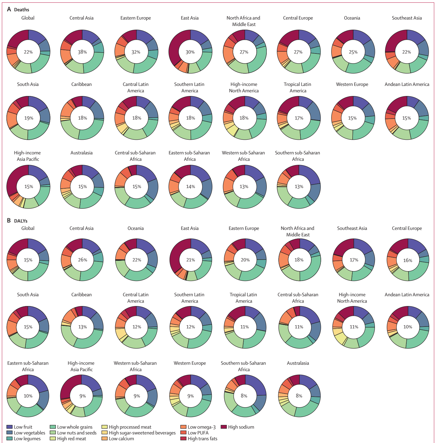
Figure 4: Age-standardised proportions of deaths and DALYs attributable to individual dietary risks at the global and regional level in 2017 DALYs=disability-adjusted life-years.

The lowest burden of exposure to dietary risk was observed in high SDI countries (139 [129–148] deaths per 100 000 population and 3032 [2802–3265] DALYs per 100 000 population). Low-middle SDI had the highest age-standardised rates of diet-related deaths and DALYs