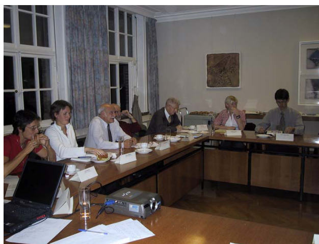
Figure 3 A discussion with local stakeholders on human biomonitoring in the Ghent Canal Zone.

Suppose in the Ghent Canal Zone a drastic rise in DNA-damage is detected, without a clear view on the cause. This is only found in this region, and not in other regions. Suppose also that in the Ghent Canal Zone a typical type of industry is present, that is not present in other areas.