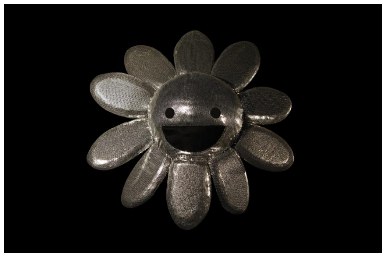
Kris Verdonck / A Two Dogs Company- Untitled

seems to tell us. The mascot in Untitled is the synthesis of the hologram's dematerialized image of the human and the material performing nonhuman machines: it is the material image, reminding of Guy Debord's assertion that The