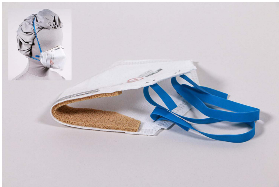
Figure 2 Picture of the ADF Poly 2+ masks.

a native Arabic speaker, has tested the final Arabic version of these user manuals with five LRC members to validate the translation prior to the dispatch of the donation from Antwerp to the LRC team in Beirut.