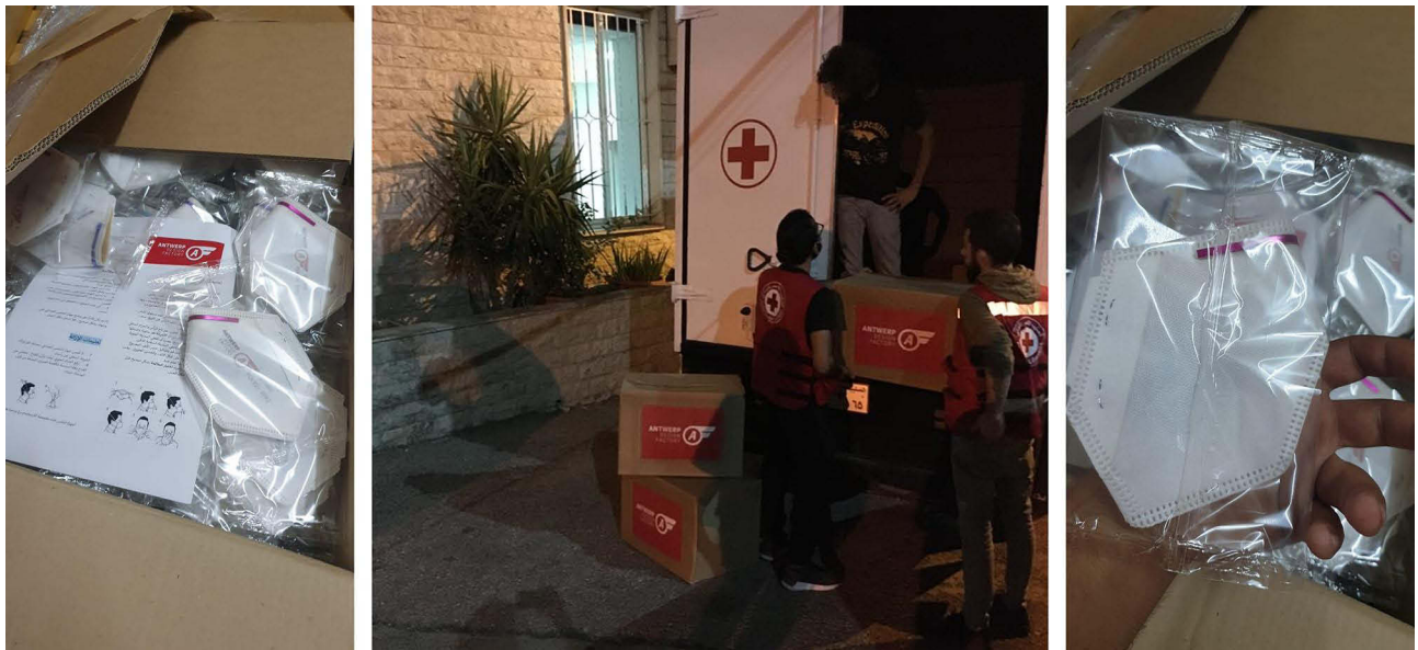
Figure 1 Picture highlighting the boxes of the Poly 2+ masks, with the user manual provided in Arabic, and their transfer to LRC's northern branch.