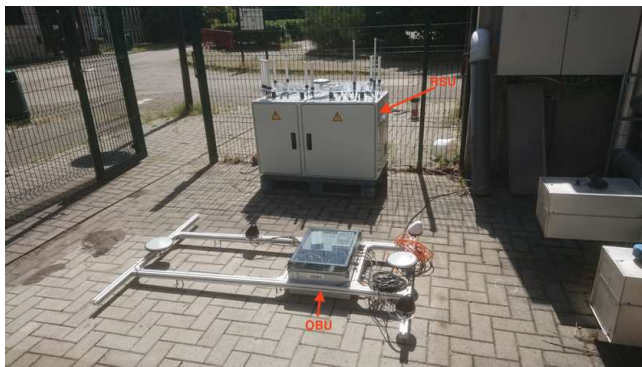
Fig. 3. Secondary test-site of the Smart Highway testbed at Campus Groenenborger of the University of Antwerp