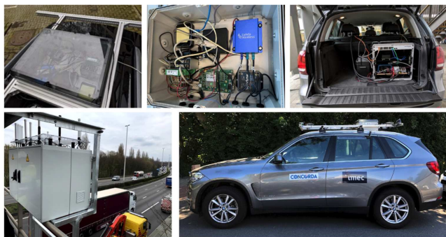
Fig. 4. Smart Highway testbed test vehicle [4]

as shown in Figure 2. The setup consists of three main components: i) the CAM message generator, ii) the CAM message decoder, and iii) the latency calculator. Within the CAM message generator we can specify the type of a CAM message, such as regular CAM message, i.e., a CAM message that consist only of its two mandatory containers. The other option is to send a Full CAM message, i.e., a CAM message that consists of its two mandatory, and two optional containers. This demo also provides insight into the process of selecting the