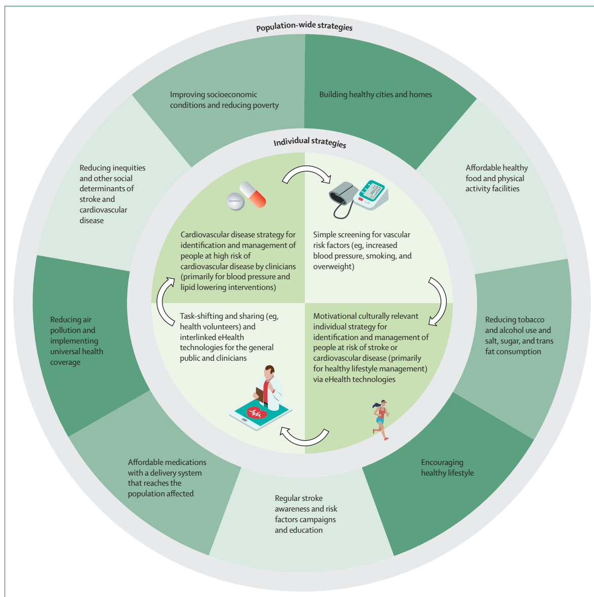
Figure 2: Action plan for governments and other policy makers for primary stroke prevention measures at the population (ie, socioeconomic, environmental, and behavioural) and individual levels

measures to reduce sodium in processed food and increase education of individuals about reducing salt and tobacco intake. 76 In addition, in HICs, where smoking prevalence has reduced and the burden associated with ischaemic stroke is noticeably higher than in LMICs, it seems reasonable to focus more heavily on the reduction of other behavioural risks (particularly on the reduction of sugar consumption and physical inactivity) and on the identification and pharmacological or surgical management of medical conditions that lead to stroke, including hypertension, diabetes, and atrial fibrillation. Population-wide and individual primary stroke and cardiovascular disease prevention strategies, 52 should be used regardless