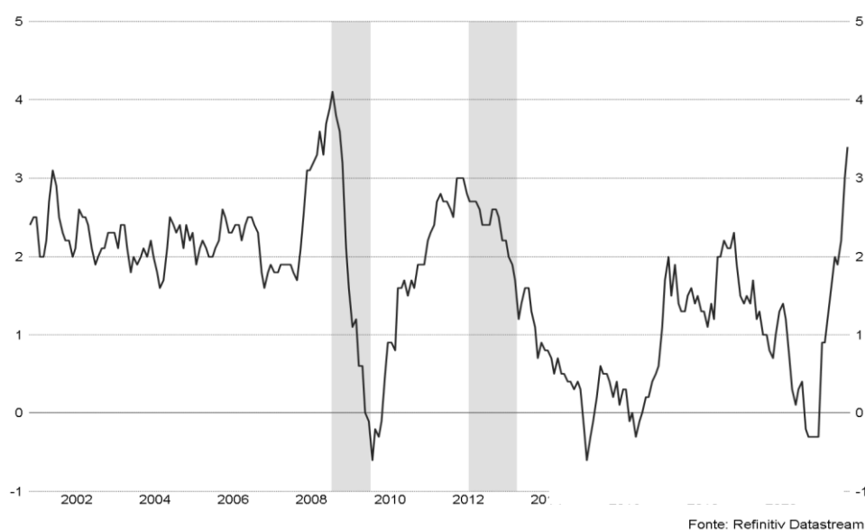
Figure 1: Eurozone Annual HICP Inflation Rate

concurrent with the changes that largely justify the ECB's 2021 strategy review. Moreover, they have significantly contributed to a critical macro-fact related to an unobservable but key policy variable: the fall in the natural interest rate. In its turn, this fall is understood to have been at the root of two other macro-facts relating to observable variables: namely, a subdued inflation rate which has averaged 1.6% in the EA from 2007 to mid-2021 (see Figure 1) and an extended stay (from mid-2014 to June 2022) of policy rates at the (effective) ZLB.