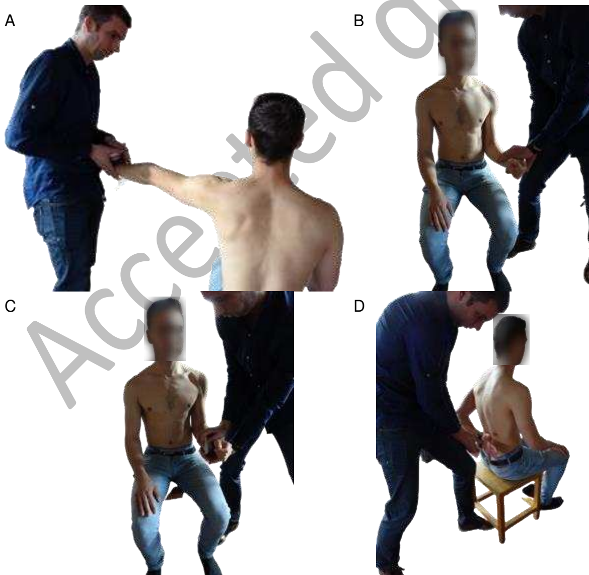
Figure 1. Test positions of muscle strength assessment. A: Abduction in scapular plane. B: External rotation. C: Internal rotation. D: Internal rotation with lift-off.

and the thumb pointing upwards. 23 The dynamometer was placed at the radial side of the wrist and patients were asked to push against the dynamometer (i.e., make test 24 ). When patients were unable to reach the full can position the test was performed 10° below their maximal shoulder abduction position in the scapular plane. For ER and IR, patients were asked to position their arm at the side with the elbow flexed 90° and the forearm in neutral position (thumb pointing upwards). 22 The dynamometer was placed on the dorsal or volar side of the wrist and patients were asked to push (i.e., make test 24 ) the hand outward (ER) or inward (IR). A second shoulder IR measurement was done in the lift-off position (hand-behind-the-back) in those patients who were able to reach this position. Patients placed their hand on the lower back, with the elbow flexed 90° and the forearm in a neutral position (thumb pointing upward). 23 The dynamometer was placed on the volar side of the wrist and patients were asked to push against it as trying to move the hand away from the back (i.e., make test 24 ). See Figure 1 for test positions.