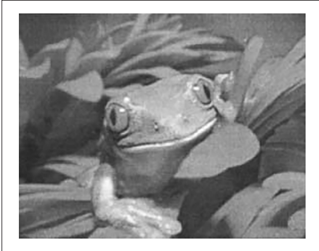
Figure 2. The source (Solution) image for Figure 1.

However, our experienced version of our environment—our current best prediction or hypothesis—is always provisional, contingent upon the sparse, biased, and indirect data we can gather to speak to and constrain our models or beliefs. In our perception (as in science), we meet the world only in our failures—our prediction errors—not in any absolute sense, but relative to the constructs with which we probe our world (Gershman, 2021; Jost, 2004; von Glasersfeld, 1995).