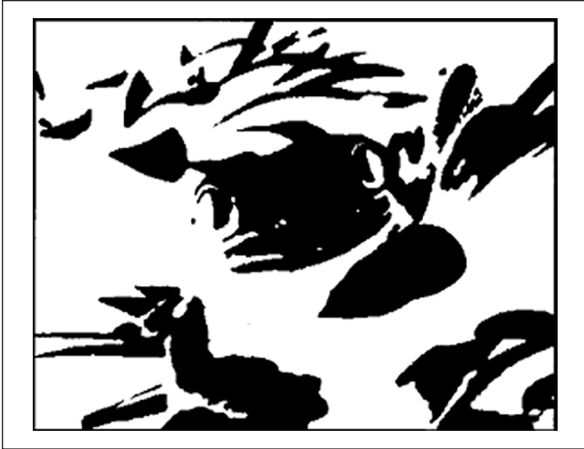
Figure 1. Two-tone or so-called mooney images are created by blurring and thresholding grayscale photographs (see the source photograph on the next page). They are examples of one-shot learning: Once you find or are confronted with the solution you cannot unsee it. “Discovery” of the familiar structure in the image, usually gives a positive feeling of insight or Aha-Erlebnis. If unsuccessful, take a look at the solution/source in Figure 2 and return to this one to (hopefully) experience the Aha.

input (and will remember the solution when later shown the image).