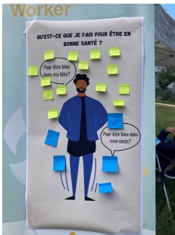
Fig. 2 Generating discussion about the perception of needs and desire for care

identified, have you met a doctor, do you need a doctor, etc. That's it! The idea is really to generate discussion.