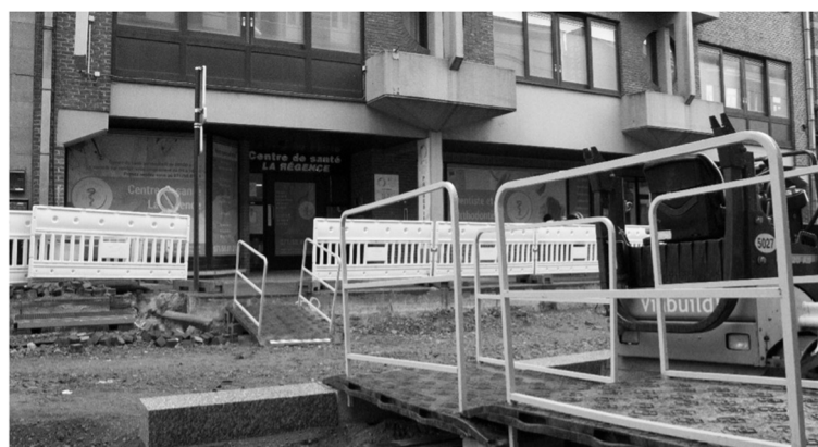
Fig. 4 Barriers in reaching healthcare.

Healthcare utilisation Interviews with both CHWs and people in socio-economically vulnerable circumstances