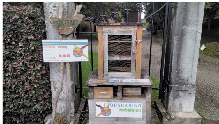
Fig. 3 Supporting to navigate the healthcare system

Reaching healthcare Experiencing difficulties in reaching health services is a literal barrier to healthcare access. The qualitative results from interviews with CHWs and people living in socio-economically vulnerable circumstances show that not everyone has the means to reach a healthcare provider independently. Especially for people with limited mobility, alternative modes of transport are often essential, but sometimes these are inaccessible, unknown or unaffordable. Lack of mobility goes hand in hand with the fact that the geographical location of healthcare services can also be a barrier (cf. Fig. 4). A CHW looks for the most appropriate support, based on a specific need, for instance by exploring possibilities for public transport to overcome barriers to physical movement. Results show that, if needed, CHWs will sometimes accompany the individual in question to reassure and motivate them or show them the route.