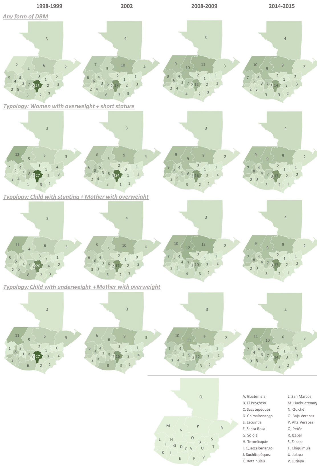
Fig. 2. Departmental prevalence and space trend of any DBM and the most prevalent typologies (Prevalence %). The figure illustrates the space evolution of the prevalence of any DBM and the most frequent typologies at the time points of 1998–99, 2002, 2008–09 and 2014–15 by the Guatemalan department (sub-divisions of Guatemalan regions). The map at the bottom of the figure provides the names of the departments. Data was obtained under request to the DHS program and included DHS data sets from Guatemala of the years 1998–99, 2002, 2008–09 and 2014–15. The data presented in this figure was generated by data analyses conducted by the authors, using the statistical software Stata. This figure was created by the authors using Microsoft Excel.