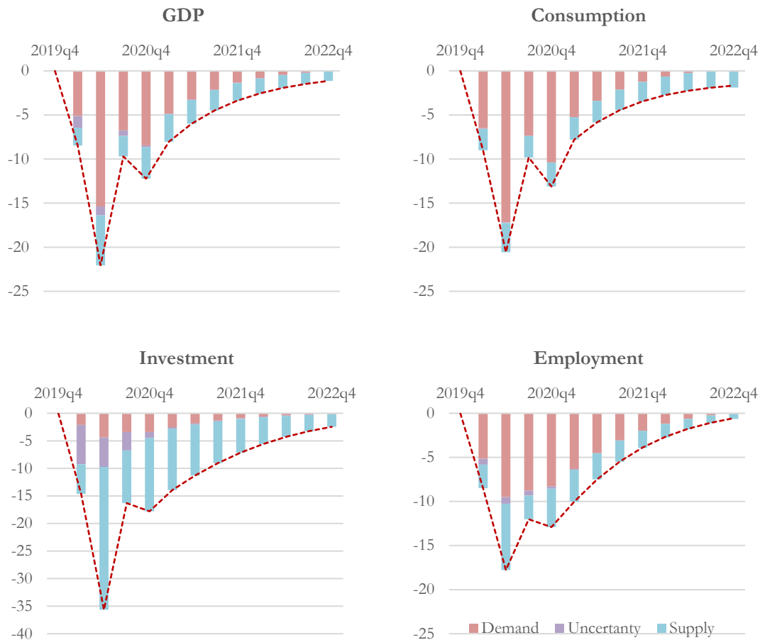
Figure 3 – COVID-19 conditional shock decomposition.

Note: The figure reports the dynamics of the macroeconomic variables in the counterfactual scenario (no policy measures) together with a decomposition of the calibrated shocks driving them, conditional on liquidity constraints on firms. The figure reports per cent deviations from the steady state (no pandemic.)